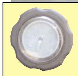
Fuel Cap with Gauge