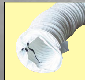
Heavy-duty Duct 25' Length (optional)