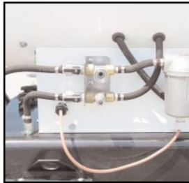
External Fuel Kit