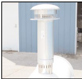
Flue Duct Kit (optional)