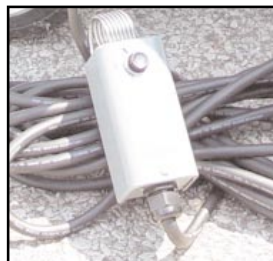
Remote Thermostat (optional)