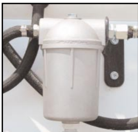
Preheated Fuel Filter (standard on 210 & 310 models)