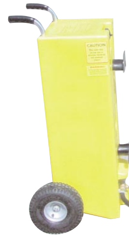
Shown with 28 Gallon Fuel Cell (optional)